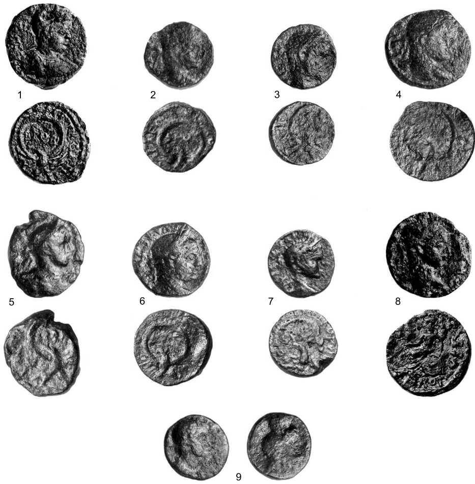
Fig. 2. Hoard A.