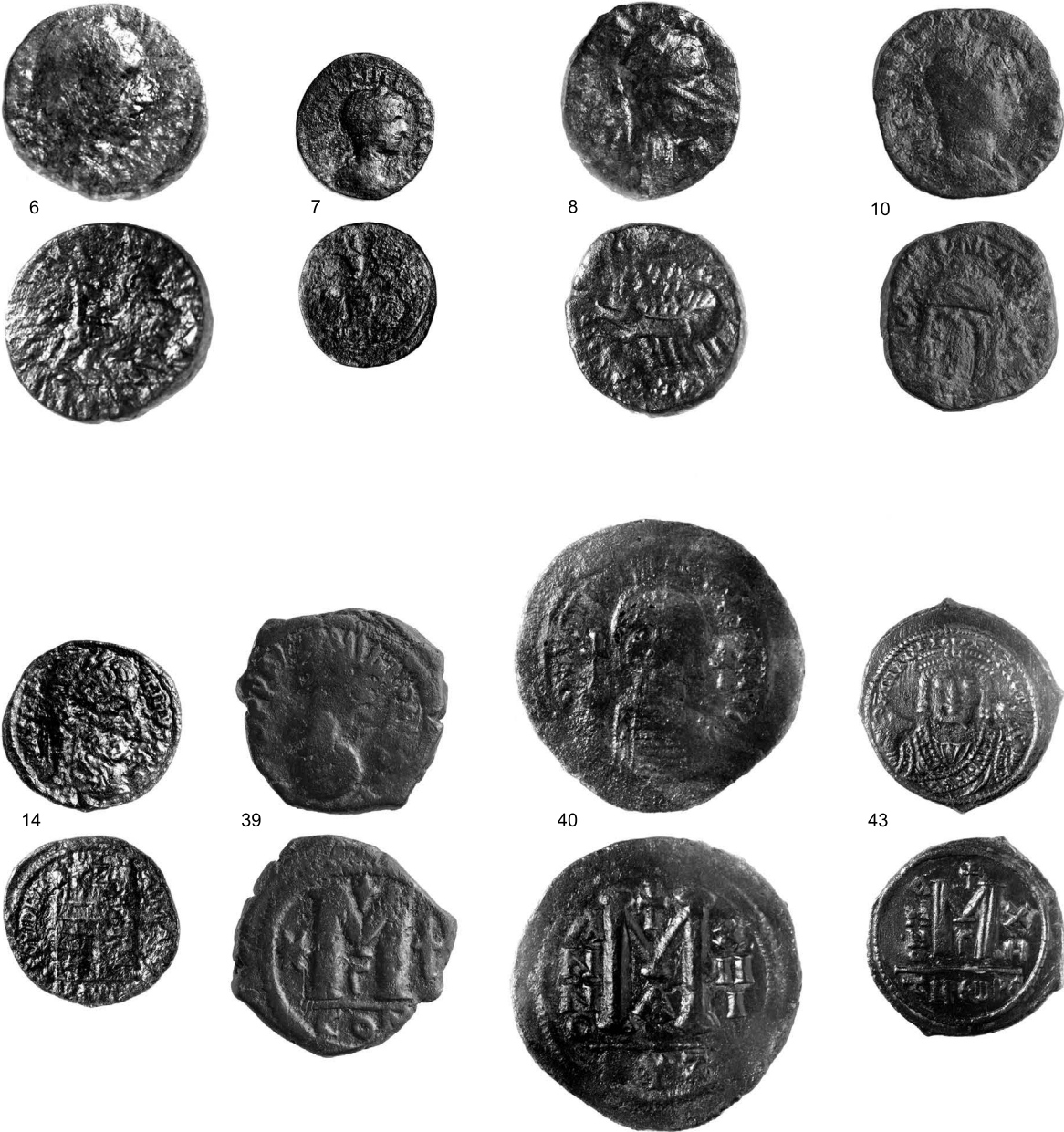
Fig. 1. Isolated coins.