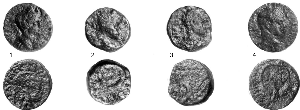
Fig. 3. Hoard B.